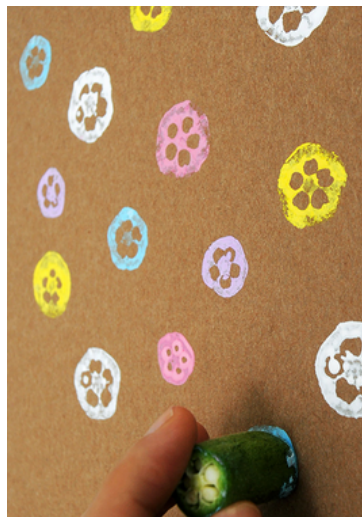
Activity and photos borrowed from www.firstpalette.com/craft/okra-stamps.html